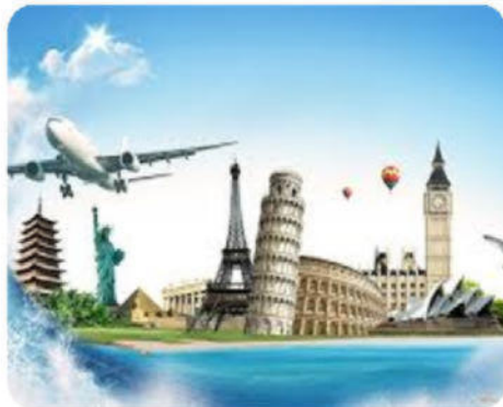
THAILAND TOUR (COUPLE-5 NIGHTS+6 DAYS)